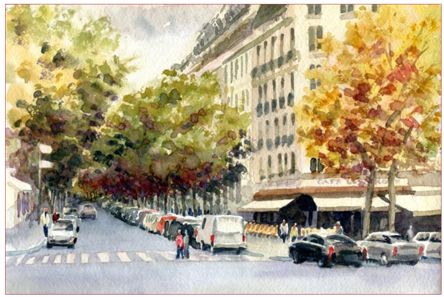
Cafe seating around Place Trocadero offers a grand view of the passing scene in an oh-so-Parisian style.